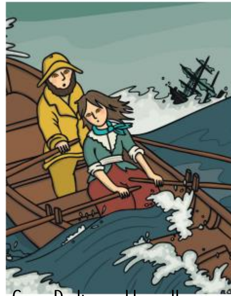
Grace Darling and her father